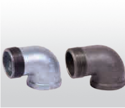
90° Street Elbow